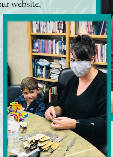
Employees and volunteers come together, while safely social distancing to put together special keepsake chimes for our Light Up a Life donors.