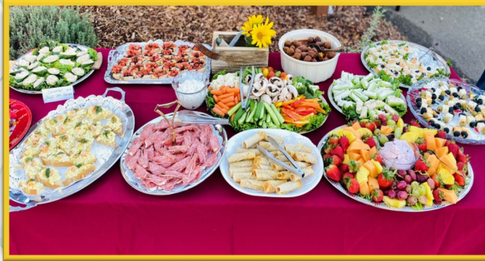
The Heartisans went above and beyond making delicious hor'dourves for party guests.