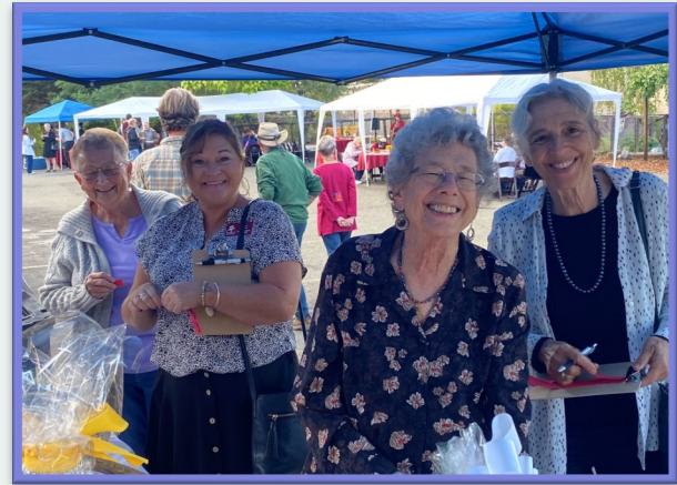
Donors made some awesome raffle prizes! Making the raffle table quite the hit, earning over $1200.00 to benefit the Senior Center.