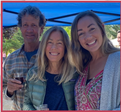
Employees brought their families to celebrate Hospice and the very important work they do.