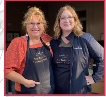
The ladies from Tri Counties Bank donated and served yummy dessert that got devoured.