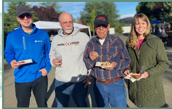
Serving our community is our main focus. The night was dedicated to them and all the support they have given, keeping our organization alive.