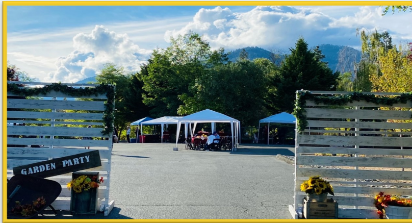
The threat of rain did not stop the festivities. The storm blew through just in time for the party, making for perfect conditions.

Thank you to everyone that attended our bi-annual Garden Party. Most importantly, thank you to everyone that made it happen. Our 2022 Garden Party was the first live event since the start of the pandemic and it really set the tone to gaining a sense of normalcy. We really loved to mingle with our supporters and be able to just say thank you. Community support has been vital to Madrone Hospice and we wouldn't be able to provide our services without you. Please enjoy a glimpse of the festivities.